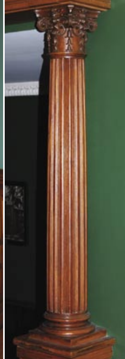
Inside this 1870s house on Exchange Street, tapered oak columns trim a doorway. Carved lineal lines that flow up the column are more complex than most preserved examples.