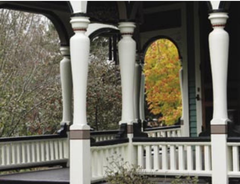
In nearby Hudson, Wisconsin, these 4-foot columns harmonize with the arches on this porch. Small ball forms just below the top of each column add subtle detail.